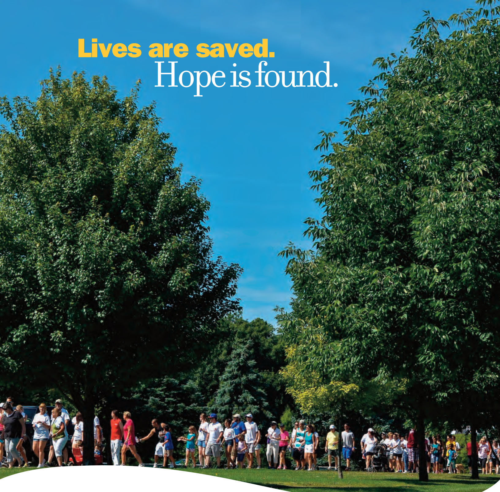
Horizon's first annual Wellness Walk, 2014