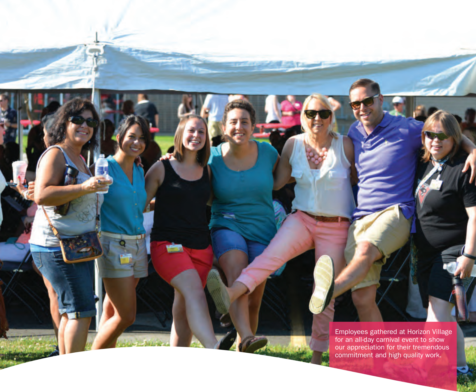
Employees gathered at Horizon Village for an all-day carnival event to show our appreciation for their tremendous commitment and high quality work.